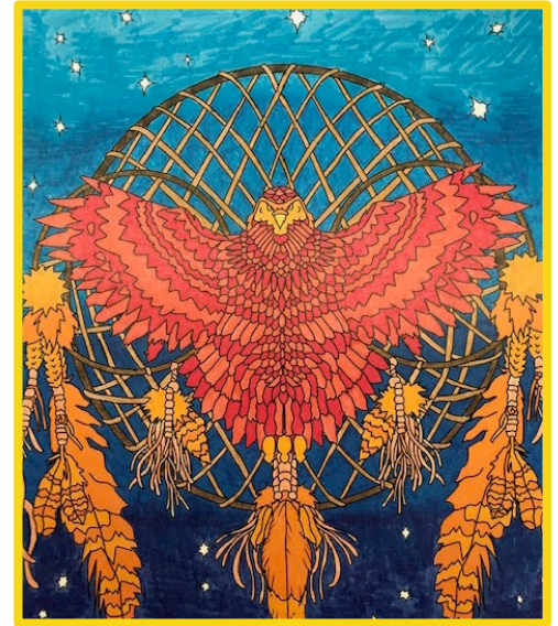
Second Place $50 Gift Card: Anezka Krobot '21